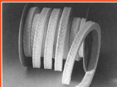
1724 AND 1724ox INTERBRAID/324 SQUARE BRAID

When you tighten conventional valve packings, you squeeze the life out of them. Protective lubricants are extruded so the packing hardens and soon leaks again. If chemicals are present, deterioration can be rapid. Conventional valve packings just don't last; so why use them? Control leaks with CHESTERTON SUPER-LON, a special PTFE packing. You can't squeeze out the lubricants, it can't harden and can't deteriorate on a wide range of services including steam up to 500°F (260°C), severe chemicals or solvents.